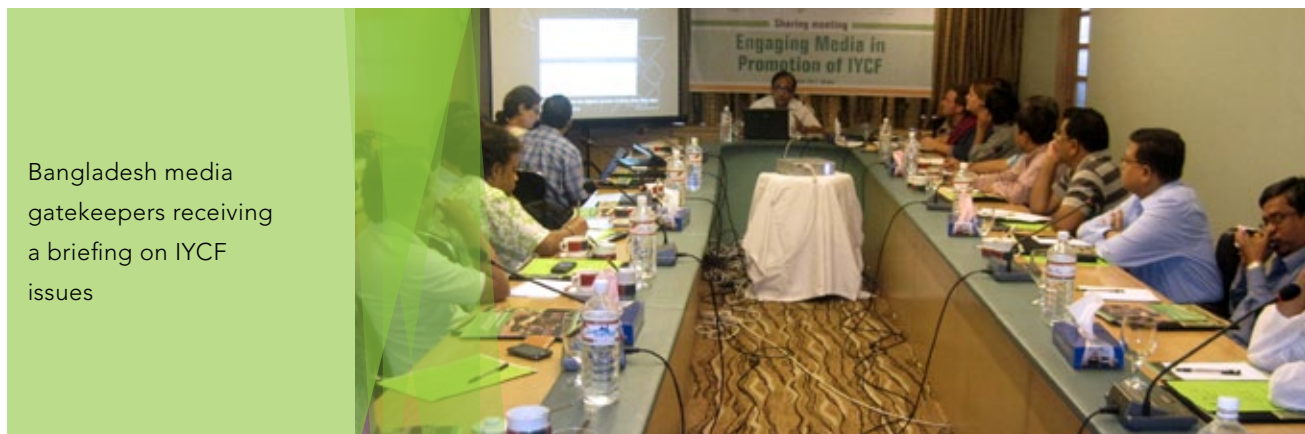
Bangladesh media gatekeepers receiving a briefing on IYCF issues

If possible, invite a prominent media expert to facilitate training sessions to provide their insight and experience with effectively telling a story and working with the media.